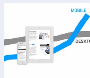
A CMS Solution for Any Mobile Strategy