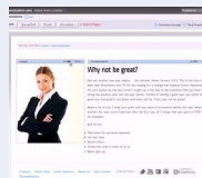
Sitefinity CMS: Website Personalization