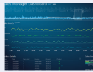
UI for WPF in Action